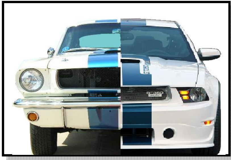
Old/New GT 350