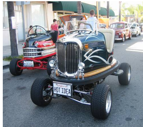
Bumper Cars, Anyone?